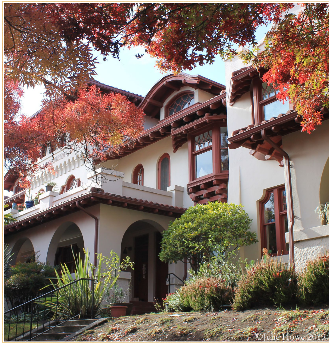
L'Amourita Cooperative - Eastlake