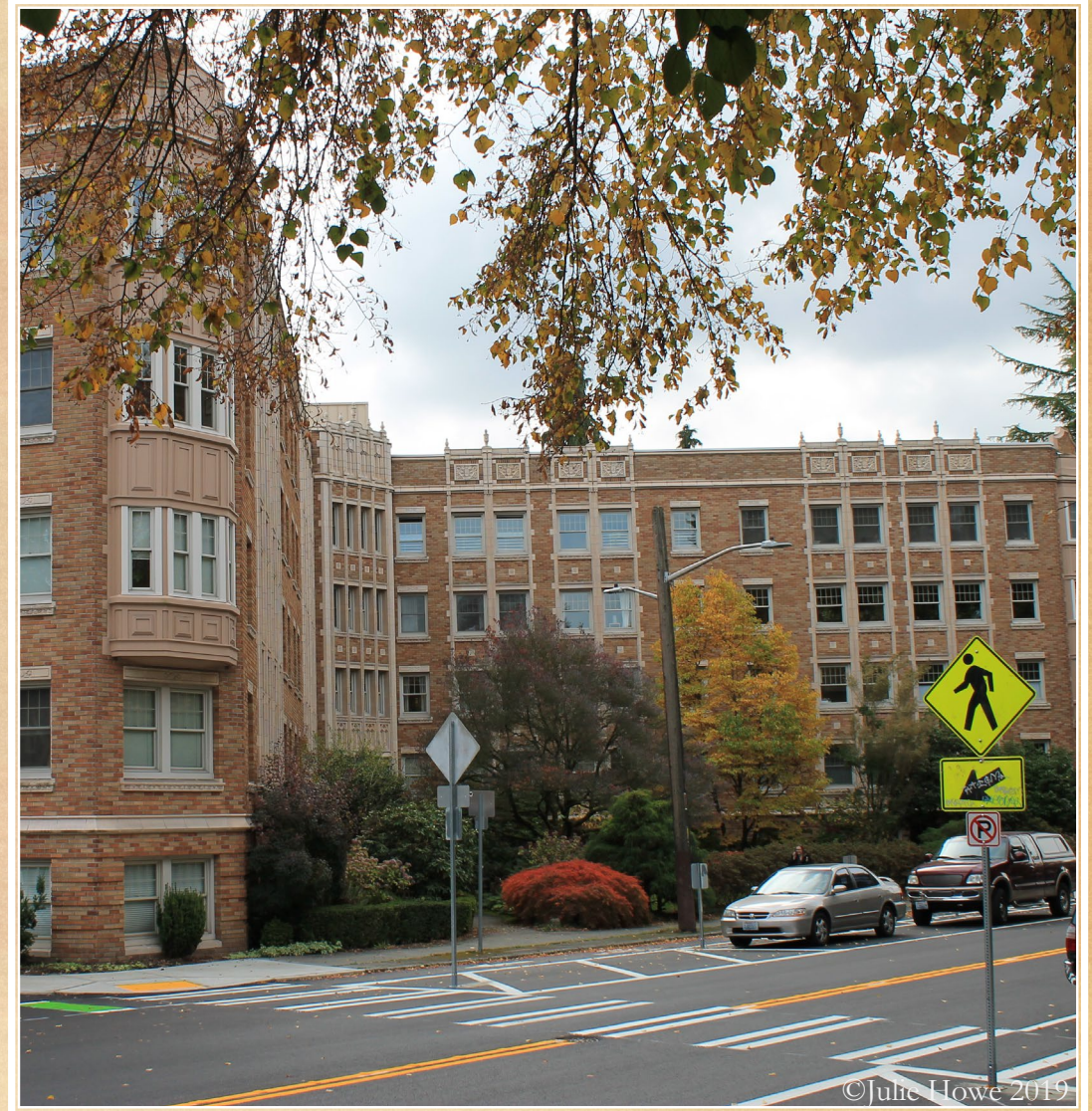
Park Vista Cooperative - Ravenna